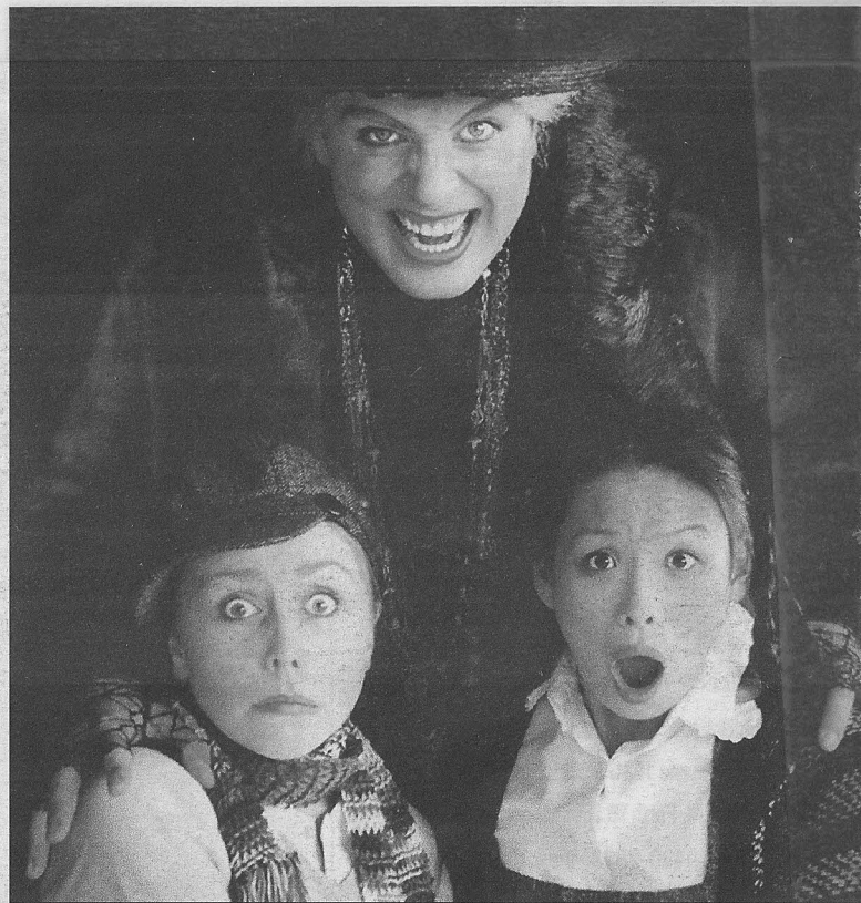
A scene from Pacific Opera's Hansel and Gretel .

Hansel and Gretel runs from July 30 to August 7 at the Glen Street Theatre. For bookings call: (02) 9275 1455 or go to glenstreet.com.au